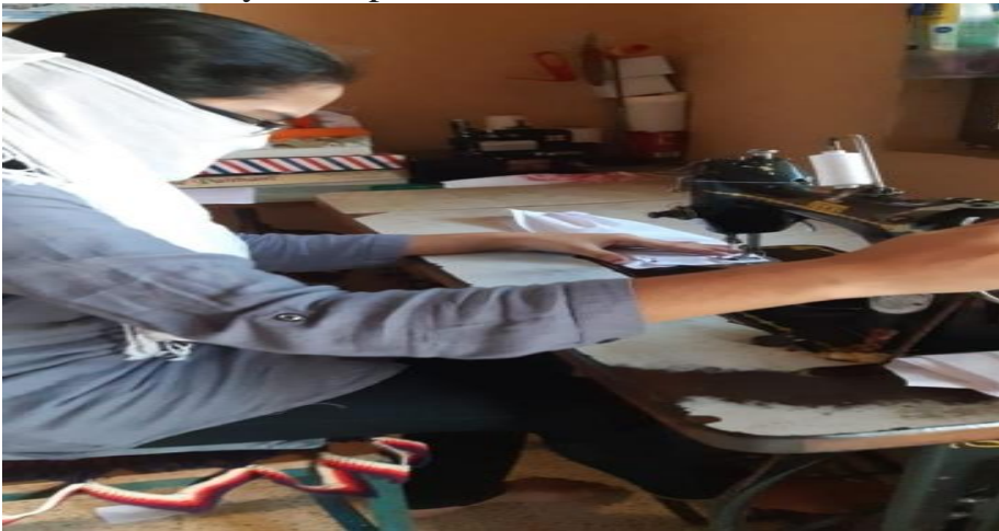
Mask Making In lockdown Period