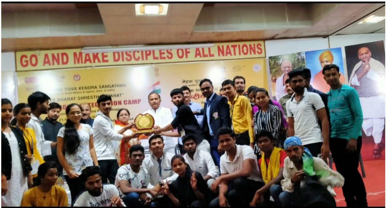
Receiving Award in National Integration Camp