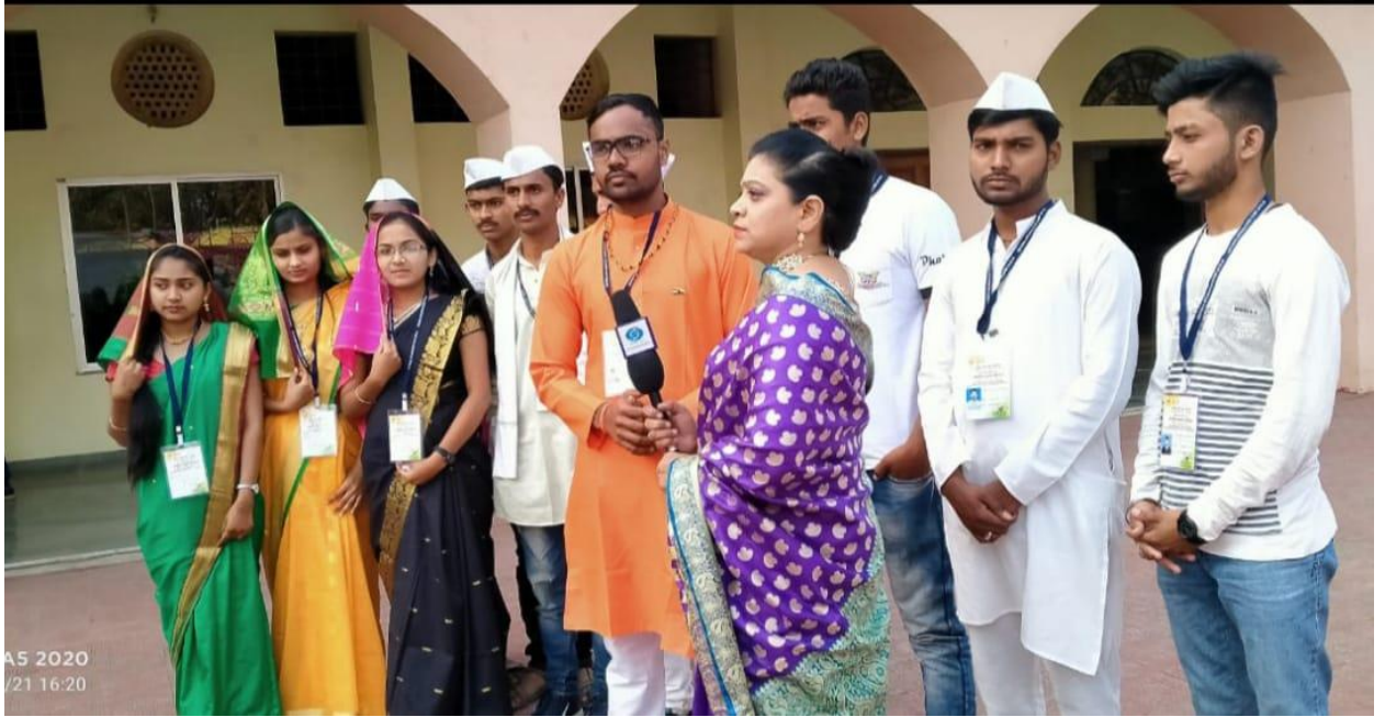
Interview about national integration camp with TV Reporter