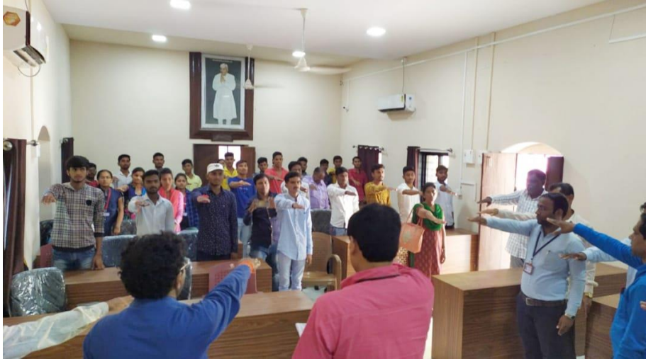
Cleanliness Pledge (02/10/2019)