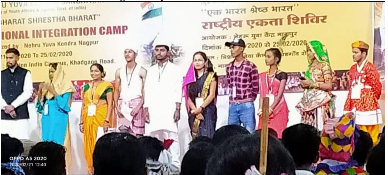
Performing Cultural Activity in National Integration camp