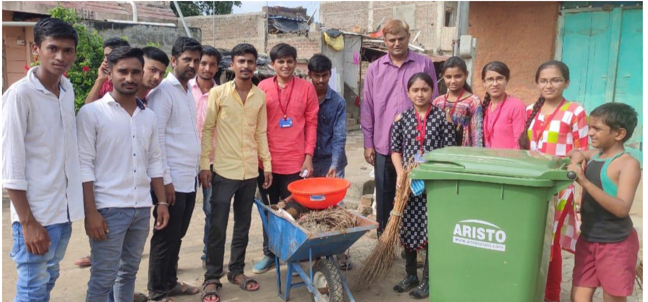
Cleaning of Adopted village under Swachha Bharat Abhiyan