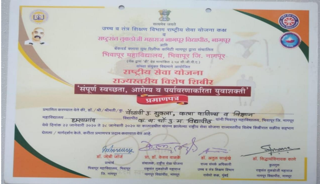
Certificate State Level camp