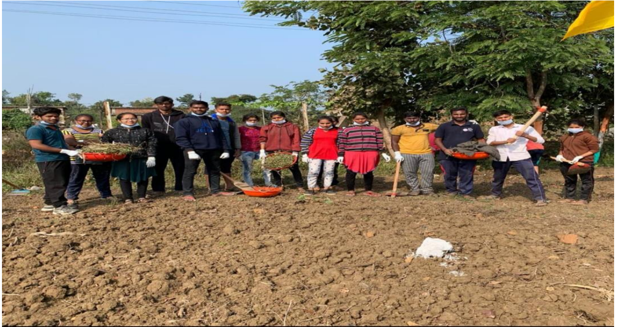
State Level Camp Working Activity