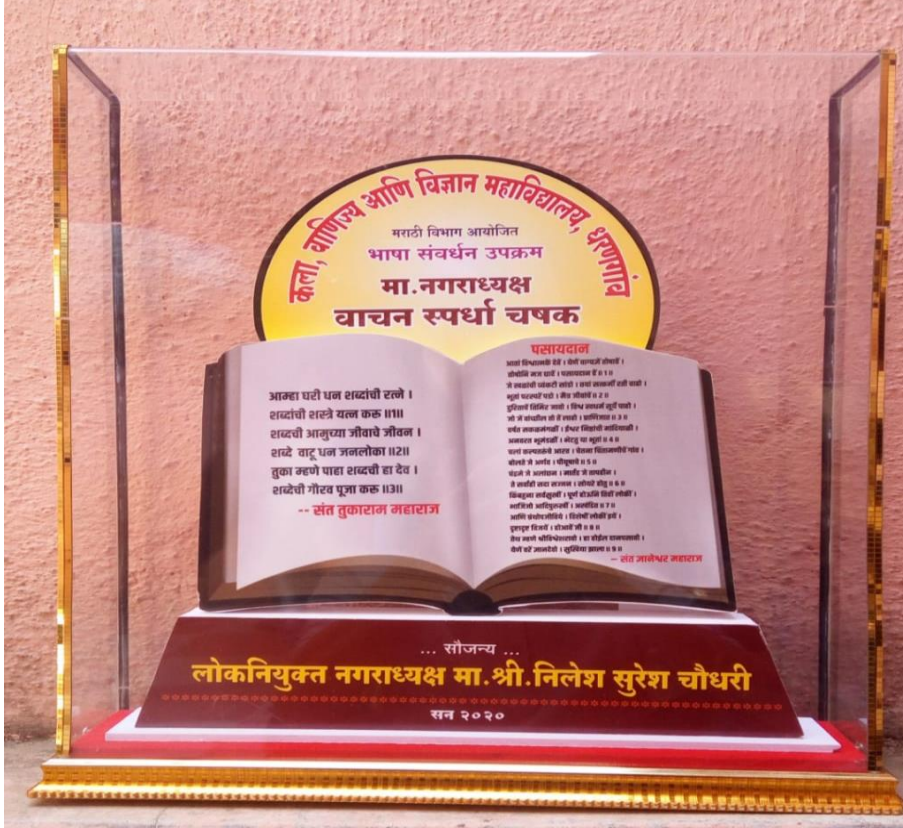
Award about Reading Competition