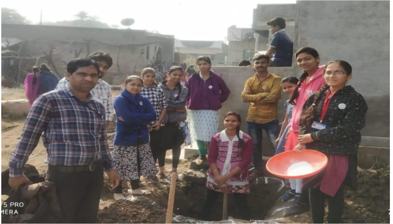
Working Hours in Special winter camp