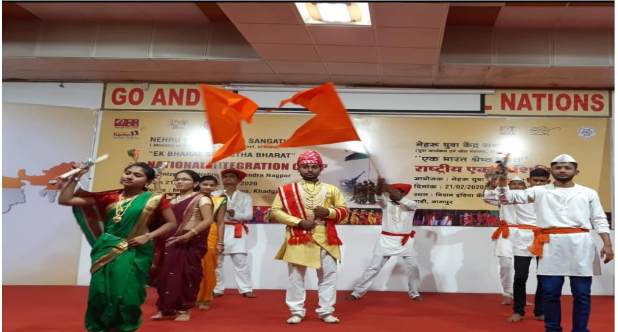
Performing Cultural Activity in National Integration camp