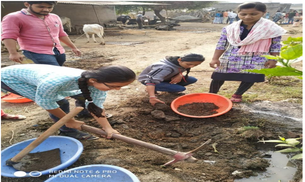
Working Hours in Special winter camp