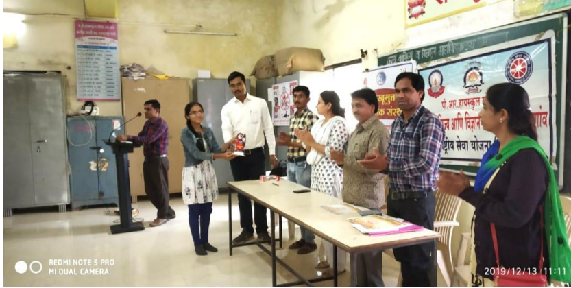
Receiving district Award about tobacco free India