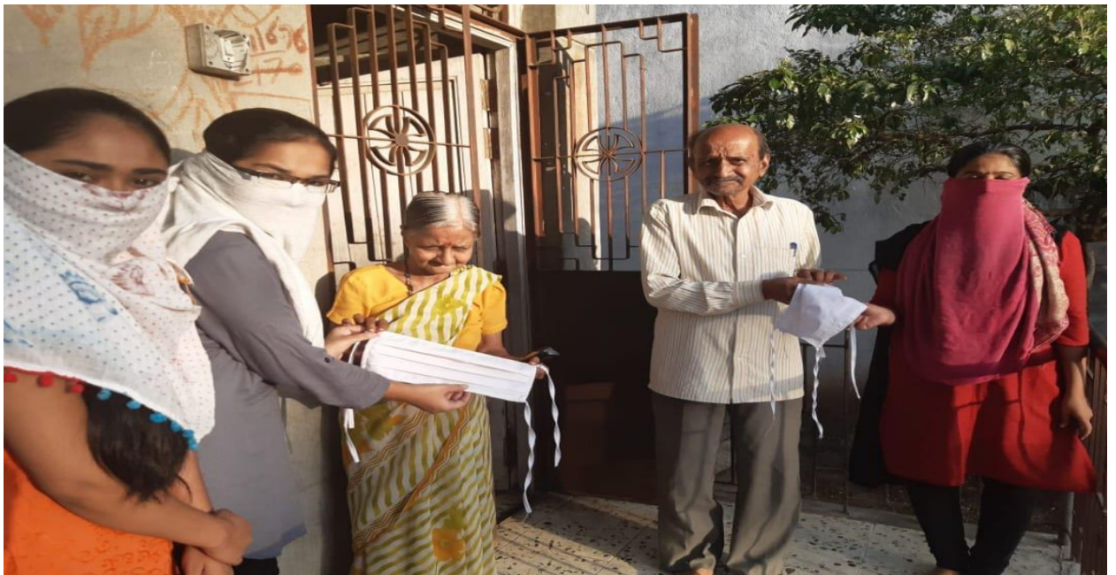
Awareness and distribution of mask in lockdown periods