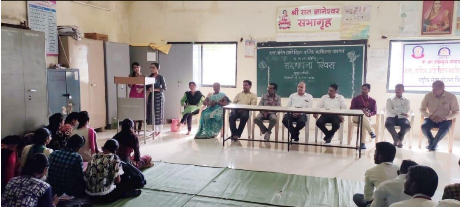
Performing Anchoring on Sadbhavna Din