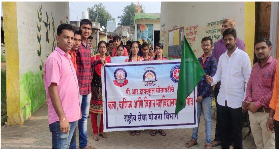
Awareness rally Participation in