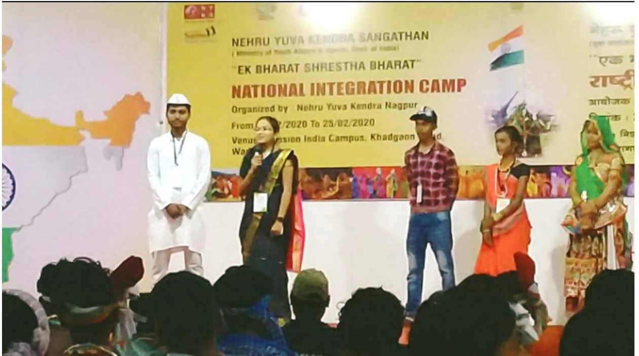
Performing Cultural Activity in National Integration camp