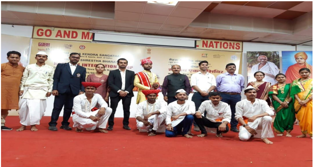
Performing Cultural Activity in National Integration camp