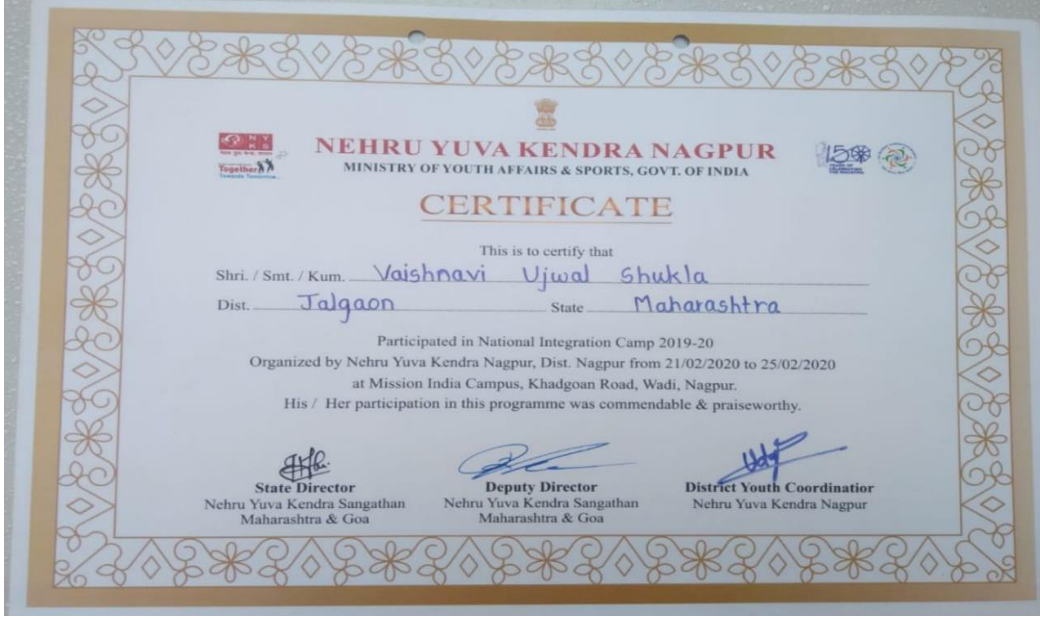
Certificate National Camp