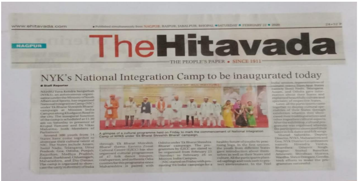
Our Cultural Activity Photo and news in English Paper